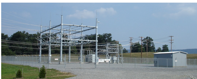
*Substation shown is a general depiction of proposed Shoals Substation and does not represent final design.